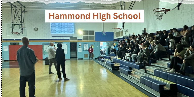
Hammond High School