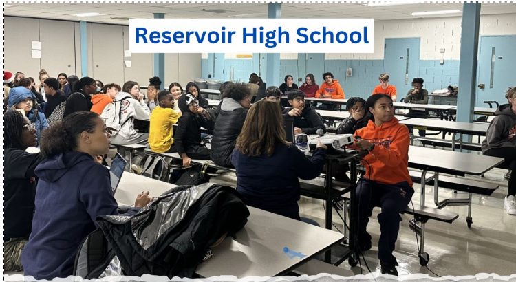
Reservoir High School