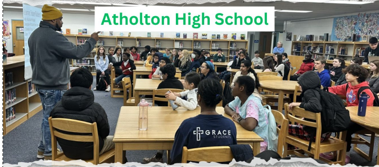
Atholton High School