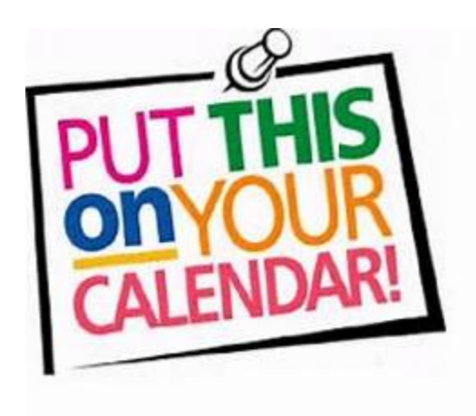
August 15 - Staff Returns

All cell phones must be silenced and put away upon entering the building. Students may carry their phone, but it must be silent and it may not be used during the day. We recommend that students place cell phones in their lockers in order to minimize the temptation to have them out during the school day. We also have a student phone in the front office that students may use when needed to contact their family.